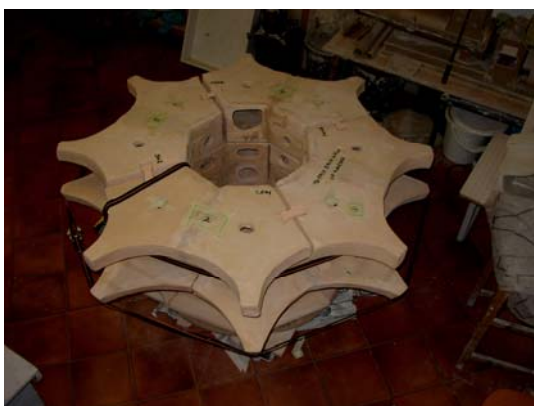
The Pillar Capital under construction